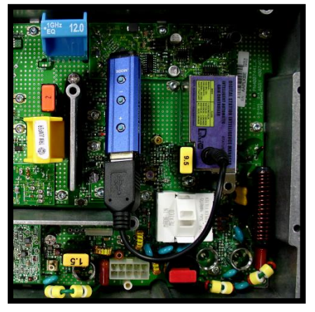
Controller Connection to DSIM (Shown with faceplate cover removed for clarity)